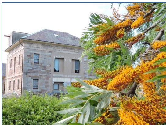
Callan Park Asylum, both photos Lyn Latella